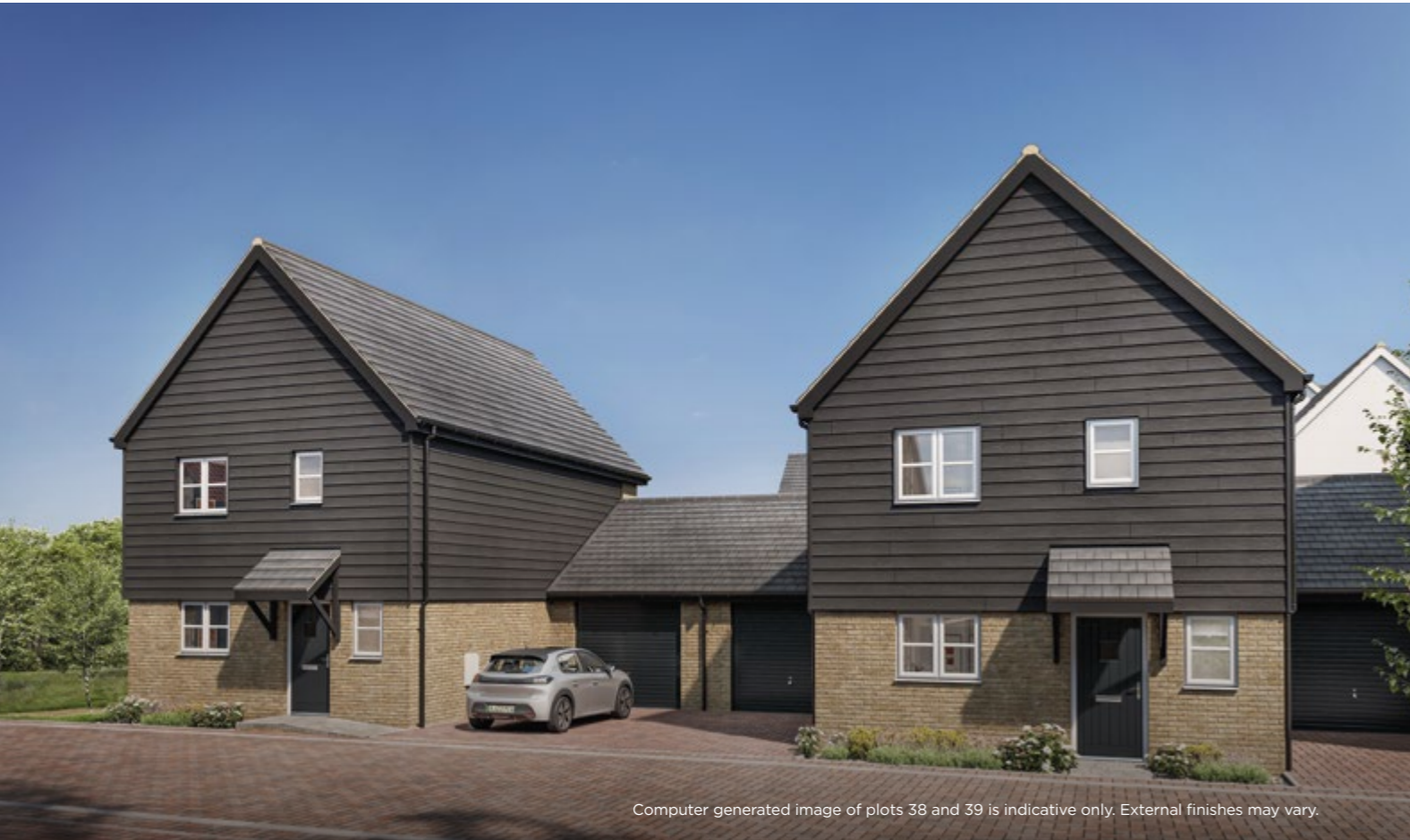
Computer generated image of plots 38 and 39 is indicative only. External finishes may vary.